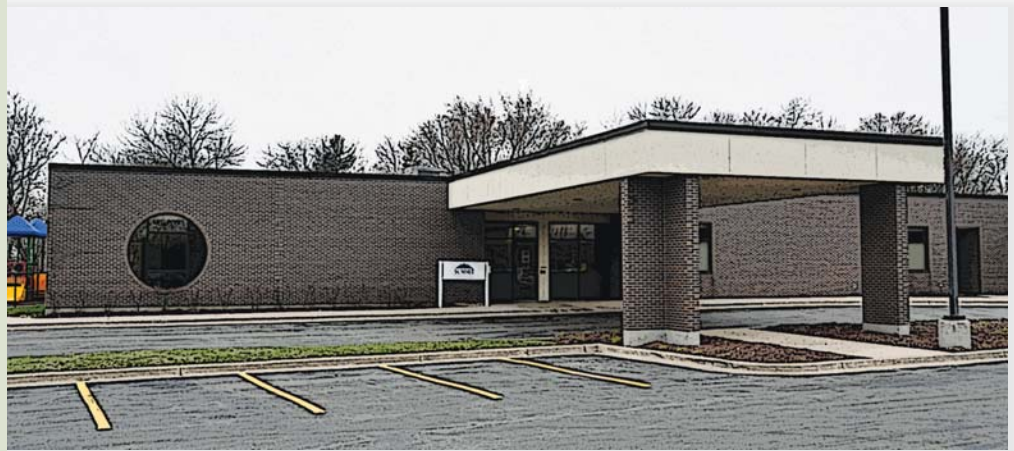
Summit School Early Education Center

Summit School Inc. specializes in teaching children by maximizing individual potential. Our targeted programs provide a caring environment in which children learn and grow. We teach children who are out of the range of standard education, including programs for children with special preschool needs, children with learning difficulties and children diagnosed with Autism Spectrum Disorder.